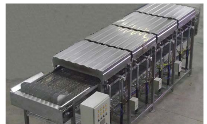
BELT TYPE ROASTER