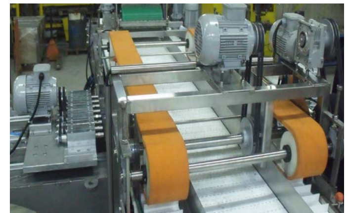
CONTINUOUS PEPPER HEAD TRIMMER-CORER