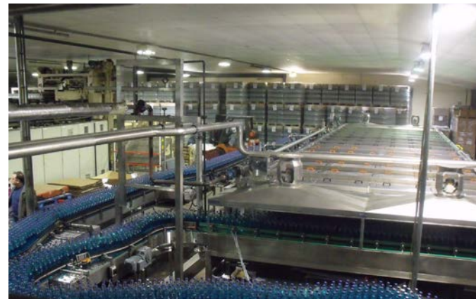
PASTEURIZATION & COOLING TUNNEL